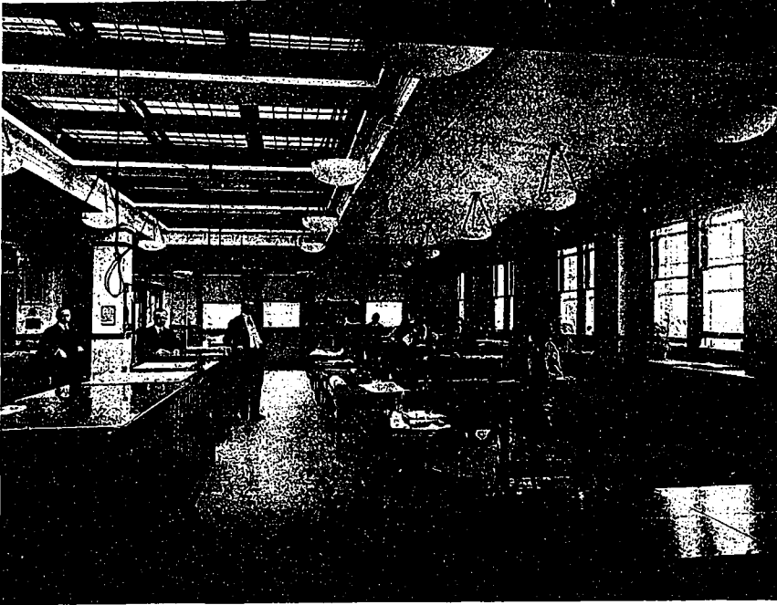
DRAUGHTING ROOM IN ADMINISTRATION BUILDING.

The main hall has a simple plaster wall treatment, relieved by antae-pilasters supporting an entablature and plaster panelled ceiling. In the centre of the building, on the main floor hallway, is a plain but beautiful mahogany enquiry bureau, where one can be put in touch, or can communicate with, any department in the building.