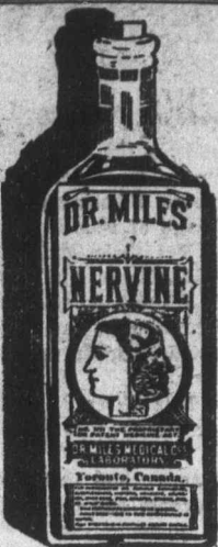
Where there is a tendency to constipation, you will find Dr. Miles' Nervine effective in keeping the bowels open.