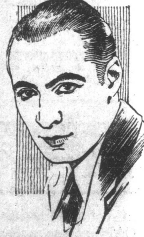
Red La Rocque in "Feet of Clay" A Paramount Picture

A picture, poignant, powerful, tremendous in its scope, superb in its artistry—dressed in all the glowing color and luxury that DeMille can weave like a cloth of gold.