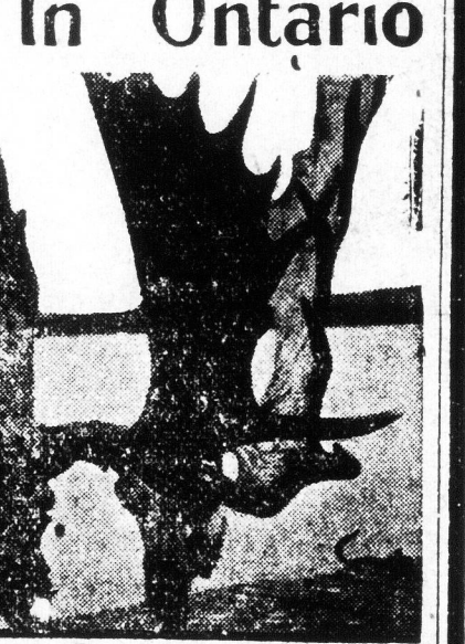
The locked antlers.

IN September and October during the rutting season, the hunters of the forest hear the sounds of a terrible combat between those giants of the forest, the bull moose. With their formidable antlers these huge creatures can span a young birch tree like a fence of matchwood, and although it is only rarely that the bull moose will attack a man if he does do so the man has little chance unless he is quick with his hot pistol. The other day, on Ignace Island, twenty-one miles east of Rossmore, on the C. P. R., a pair of locked moose horns was found as the tragic record of a combat. They had evidently been fighting when the antlers became entangled and unable to extricate each other the two animals died there of starvation, their