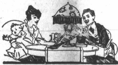
At age 30 he wisely increases his insurance.