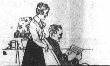
At age 60 his "Estate" fully paid for becomes a substantial fund, earning dividends.

The records of the Surrogate Office of New York County, covering a period of five years, showed that the average number of deaths among adults for those years was 27,011. Of these: 23,051 or 85 per cent. left no estate at all. 1,171, or over 4 per cent. left estates valued at $300 to $1,000. 1,428, or over 5 per cent. left estates of more than $1,000, but less than $5,000. 476, or nearly 2 per cent. left estates of more than $5,000, but less than $10,000. 490, or nearly 2 per cent. left estates of more than $10,000, but less than $25,000.