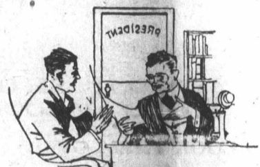
At age 40 he finds the security of his Estate unquestioned by his Banker.