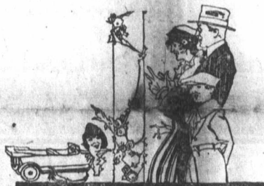
At age 50 he has no fear of hardship for himself or his family.