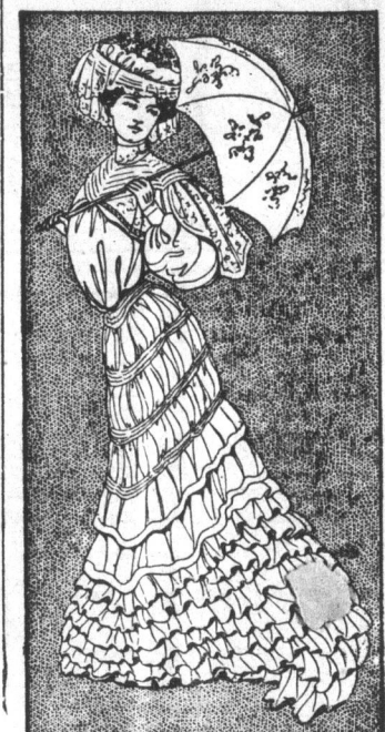
GARDEN PARTY GOWN IN CHINA SILK.

Another dainty garment of the season is a white china silk waist, finely