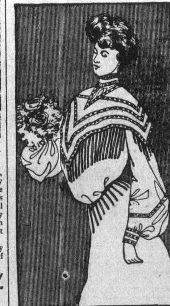
WHITE SILK WAIST.

And for half mourning—for dull, chilly weather—for an afternoon gown