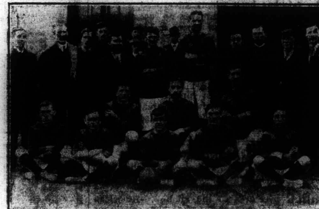
THE DUFFERIN RIFLES TEAM