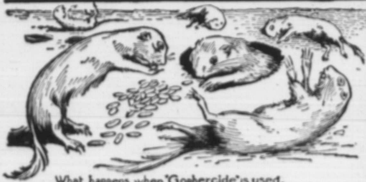
What happens when 'Gophercide' is used.