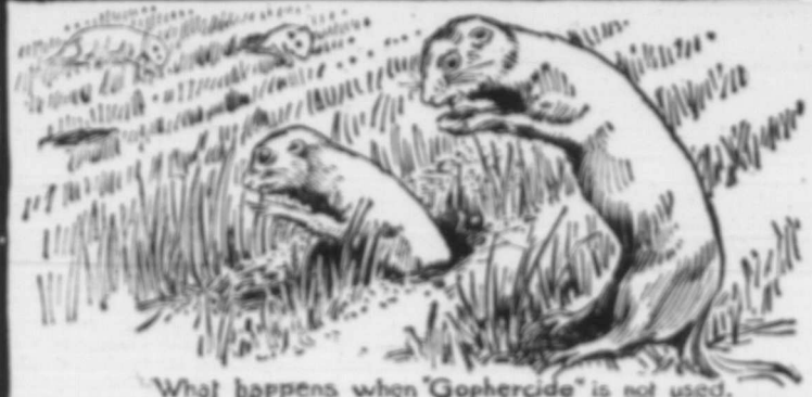
What happens when 'Gophercide' is not used.