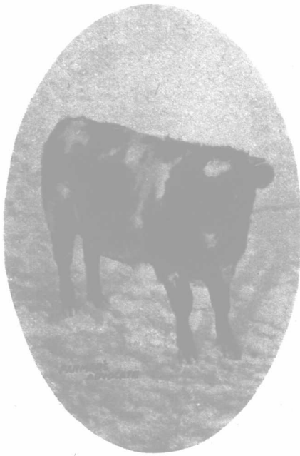
IMP. DIAMOND PRINCE.