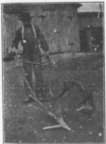
A Home Made Turnip Harvester.

Western Ontario Dairymen's Association convention, St. Thomas, January 13 and 14.