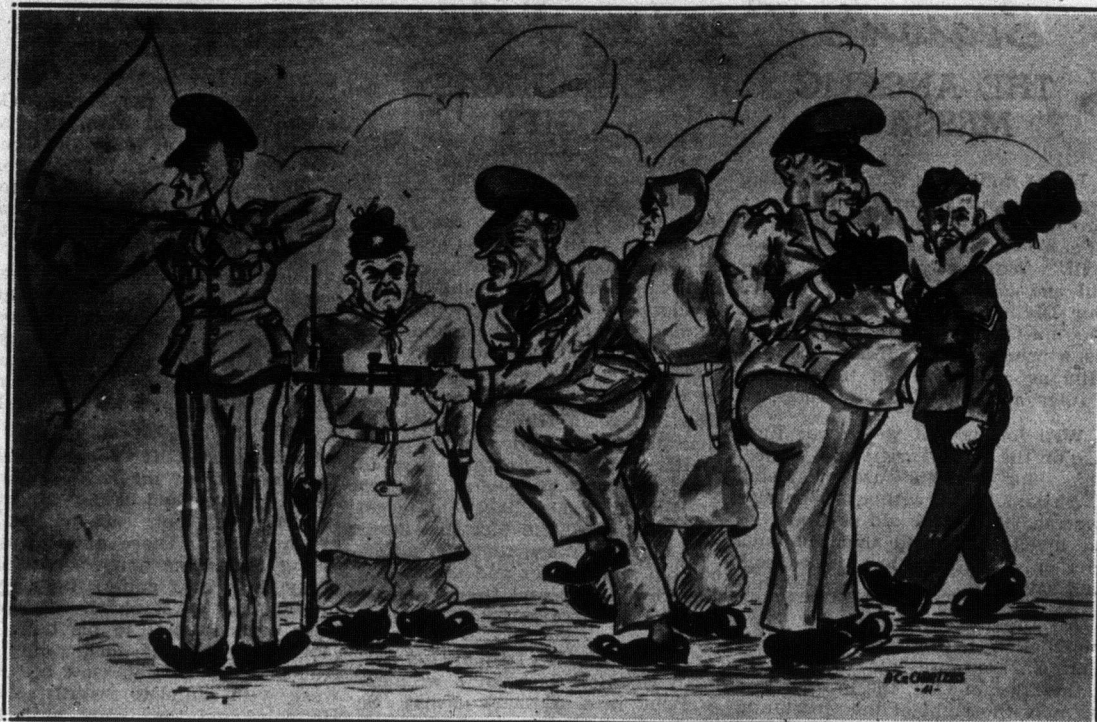
A HAPPY NEW YEAR—SECURITY GUARD