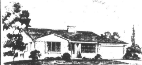
THE PINE GABLE $49,211

FLOODLIT FURNISHED MODELS OPEN FOR INSPECTION