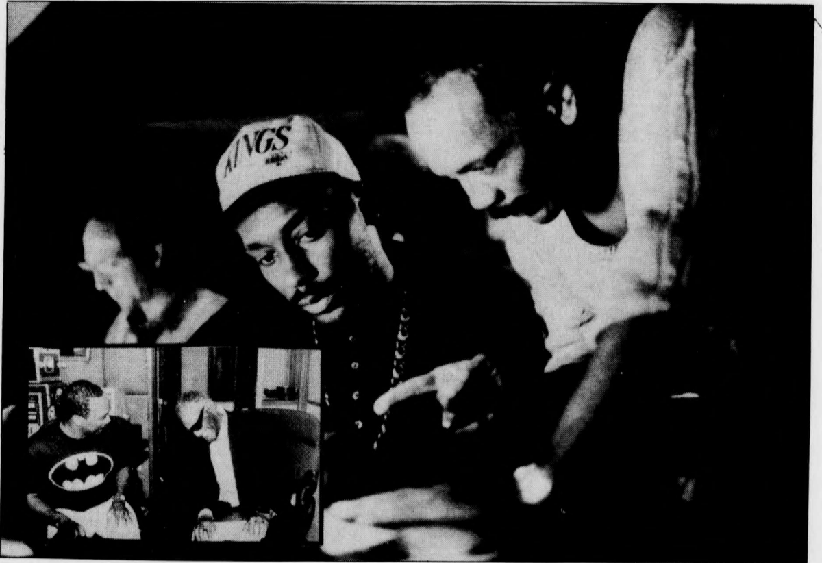
Hey, those guys look familiar, especially the one in the Batman shirt.