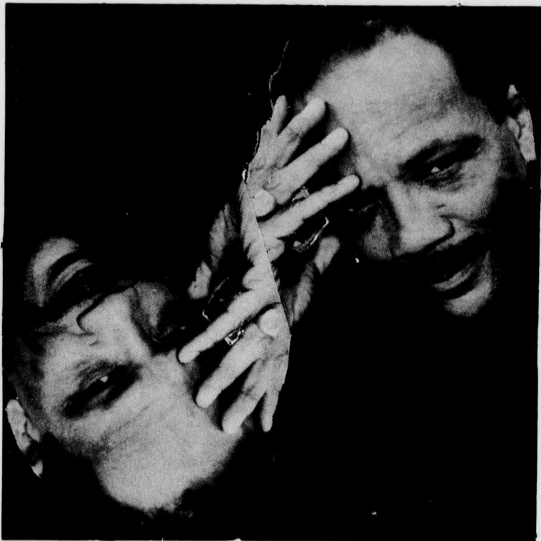
Les yeux sans visage

album, Dizzy Gillespie, Ella Fitzgerald, Sarah Vaughan, Bobby McFerrin, etc., speak candidly about Jones' forty years in the music business. They offer a combination of both words and actions, the actions being their performances, which illustrates how and why he has become such a gifted producer.