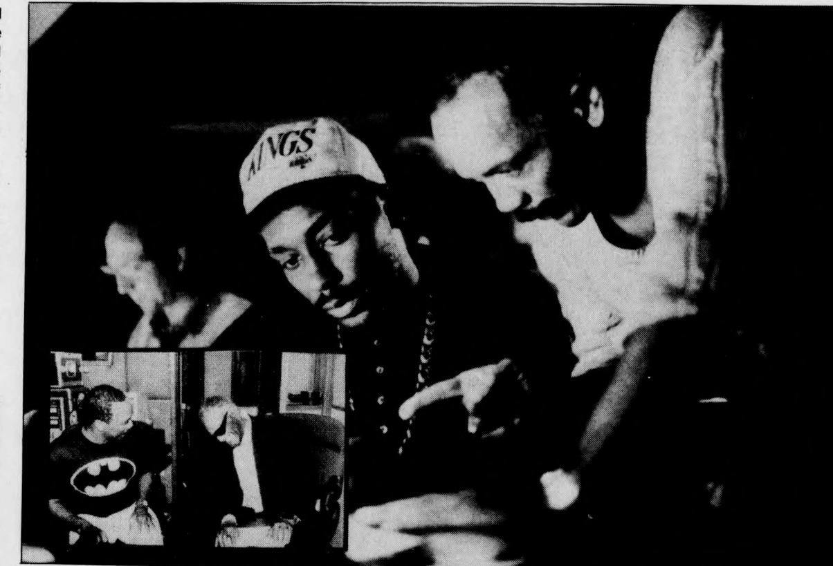
Hey, those guys look familiar, especially the one in the Batman shirt.