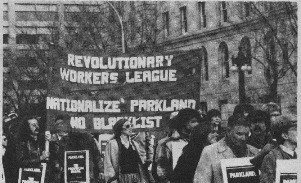
Members of the RWL lead a march protesting the unfair treatment of Parkland workers.

The RWL has an office and bookstore at 10815B Whyte Avenue. Interested people can stop in and talk, or call the office at 432-7358.