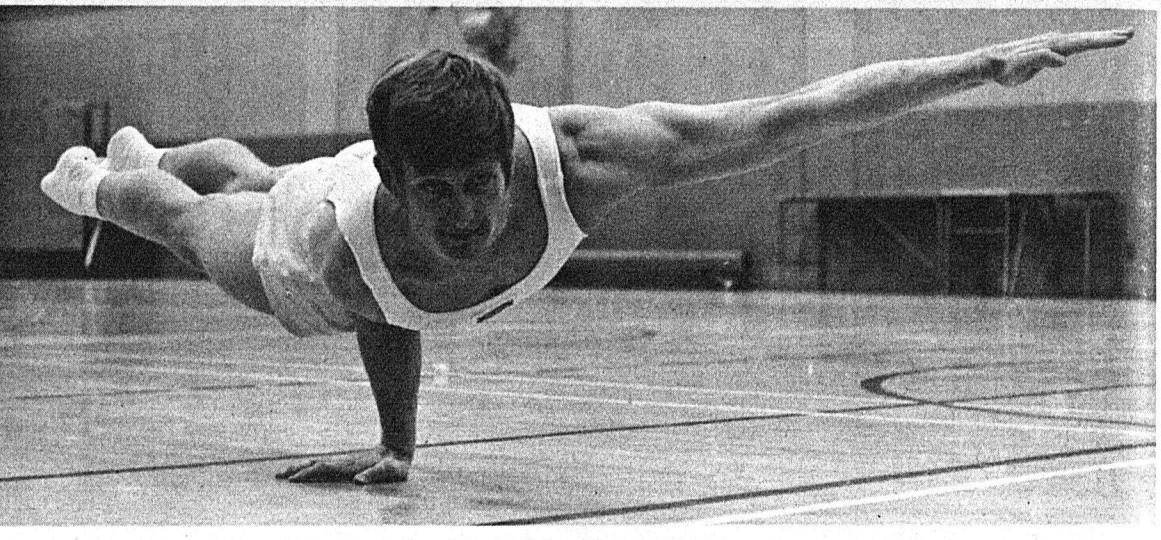
LOOK, MA, ONE HAND