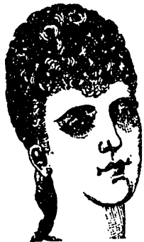
This handsome style of Bangs, $6.00.

(South-East Cor. of Yonge and Carlton Sts.)