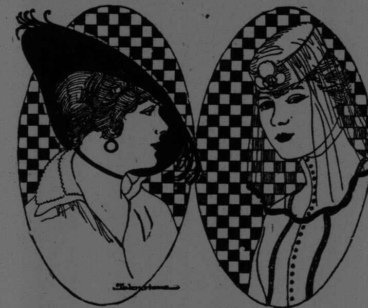
Nifty last spring, but—