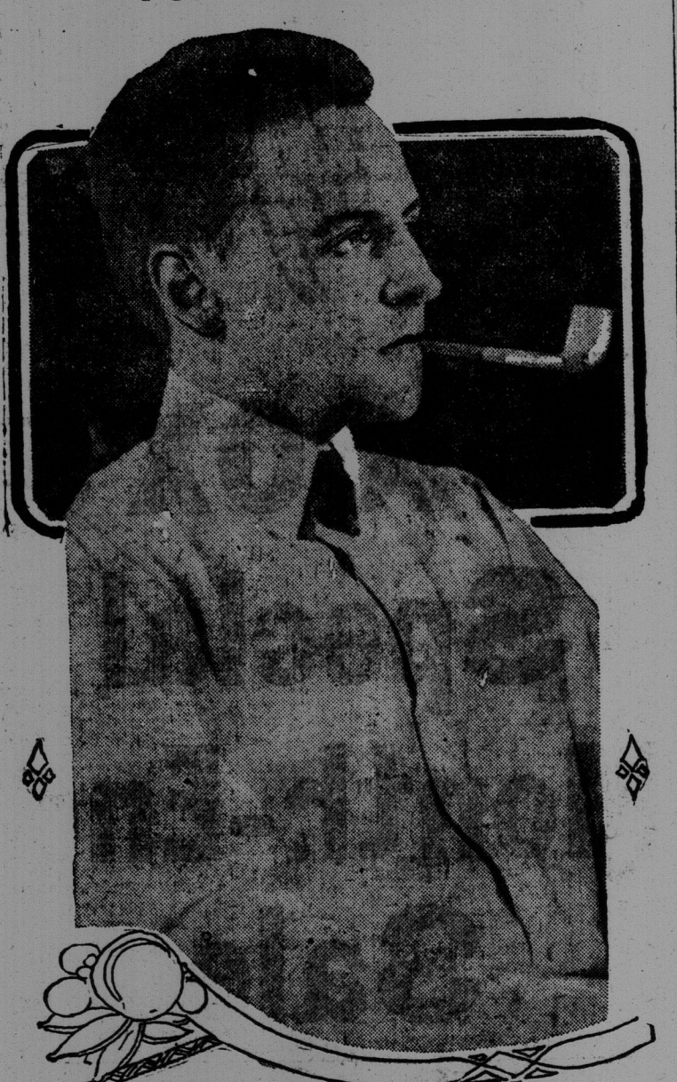
His trial for murder of his bride, in Italy, has just ended in sentence to a short term in prison.