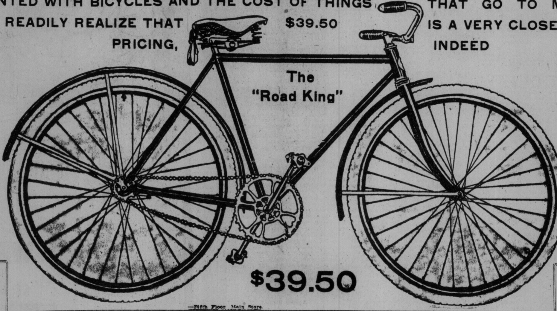
The "Road King"