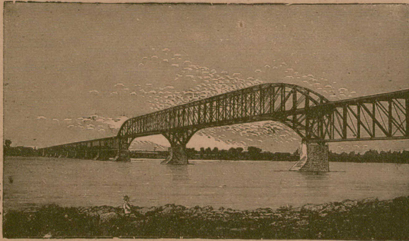
ST. LAWRENCE RIVER BRIDGE, CANADIAN PACIFIC RAILWAY, LACHINE, P. Q.

Railways and Highways Iron Bridges, Turntables Iron Piers and Trestles Bridge Rods Right and Left Hand Sleeve Nuts and all kinds of Structural Iron Work.