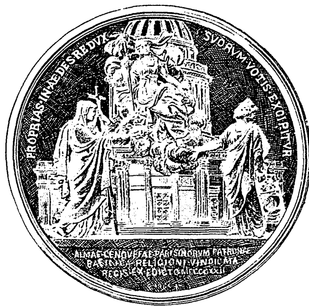
SILVER MEDAL PRESENTED BY SIR HECTOR LANGEVIN TO THE OTTAWA BRANCH OF THE VILLE MARIE CONVENTUAL SCHOOL.

The closing exercises of the scholastic year at the Convent Congregation de Notre-Dame at Ottawa, a branch house of Ville-Marie, took place on the 27th June. Among the various