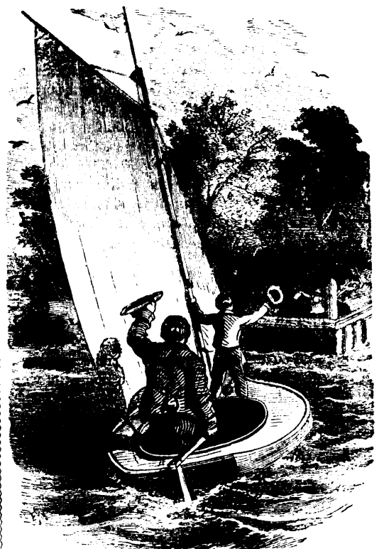
FATHER'S WELCOME HOME.

Below is the raft again. How sad those boys look now! You would hardly think them the same boys you see in the other picture. They are meant for the same, however. But why are they so much troubled? What makes them wear such long, sober faces? I will tell you. They are disobedient now. They took the raft this time without permission. Worse, they took it against positive orders never to get upon it unless their big brother or father was with them. But to-day they thought it would be fine fun to go out by themselves. They pushed it from the shore, hoisted the sail, and for a while were as gay as two silly butterflies. But very soon they found the raft going far away from their island home. They could not steer it round. They could not pull down the sail. Then it seemed that they