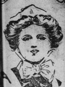
Little Lectures NURSE 'WINCARNIS.' (Lecture No. 3.)