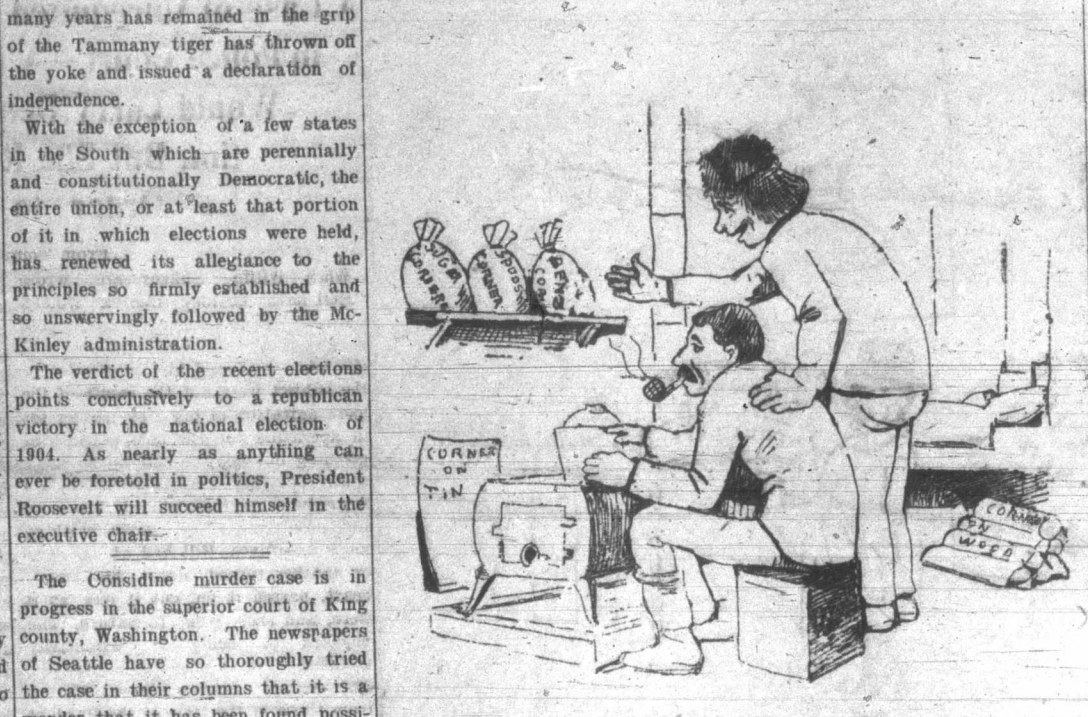
'IF OUR FIGURES ARE RIGHT, THEY'VE GOT TO COME TO US.

have there been so many corners in chance by betting, one $5, the other ommodities made as this year. Not $7.50, that the river would not close that the people at large have known until after November 16th. Had they of these corners, for they hav'nt, as lost they might have been forced to none of the corners referred to have make a drive on their half sack of Nearly all the States in the union except in the minds and spuds and 25 lbs. of beans to liquiimaginations of a couple of chechaeos date their losses, but they won. With pleased with their glacier? It is in which elections have occurred this existed who are seeing ice in the river for the their increased capital they became policies of the Republican party. first time. Some time ago these new- even more daring. Yesterday two