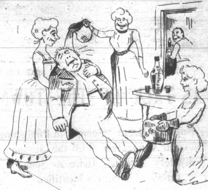
HE FLOPPED UP AND FAINTED.

A good story illustrating the fear a large man may have for a small By all means foster the glacier, and the water does not coze out of the woman, especially when the small