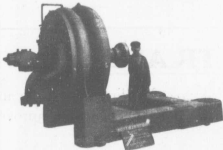
Worthington 2 Stage Turbine Pump for the Winnipeg Water Works, Capacity 5,000,000 per 24 hours.

We Have Two Stage Pumps in Operation Delivering Against 160 Pounds Pressure