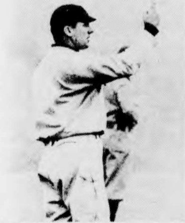
GIVE ME RAVEEN! Legendary New York Giants manager John McGraw found out quickly that the signs he flashed from the dugout were readily adaptable into hypnotic suggestions

In reality, Houdini was the great-grandfather of sports hypnotists, and though many followed in his footsteps, none could match his success. After Houdini, baseball hypnotists went underground, away from the glare of the media, and by the