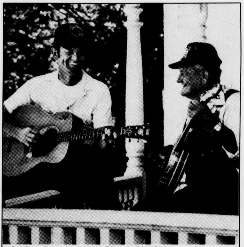
Jack Daniel's Tennessee Whiskey is represented in Canada by FBM Distillery Ltd., Brampton, Ontario

Carnation Sportswear 437 Spadina Ave. (at College St.) Toronto 979-2707