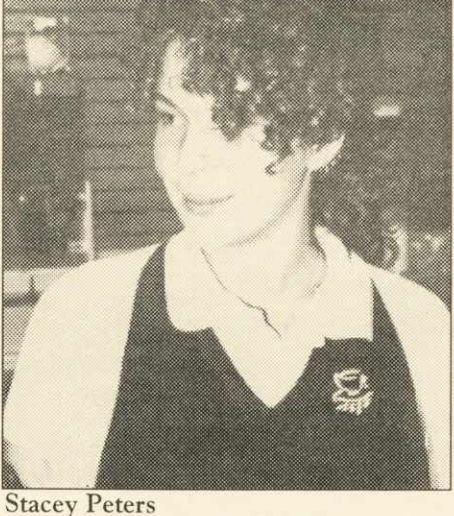
Beaver Foods employee "Hectic. Really hectic. There was a lot of people here. It was very busy here."