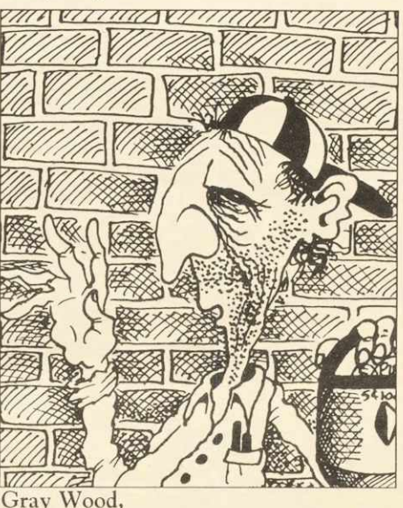
Ist Year Political Science "I managed to do some very crucial networking with my peers."