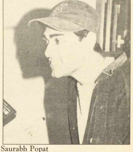
4th year, Biology "It was a good time — a little stressful, but I feel like it should be a good year."