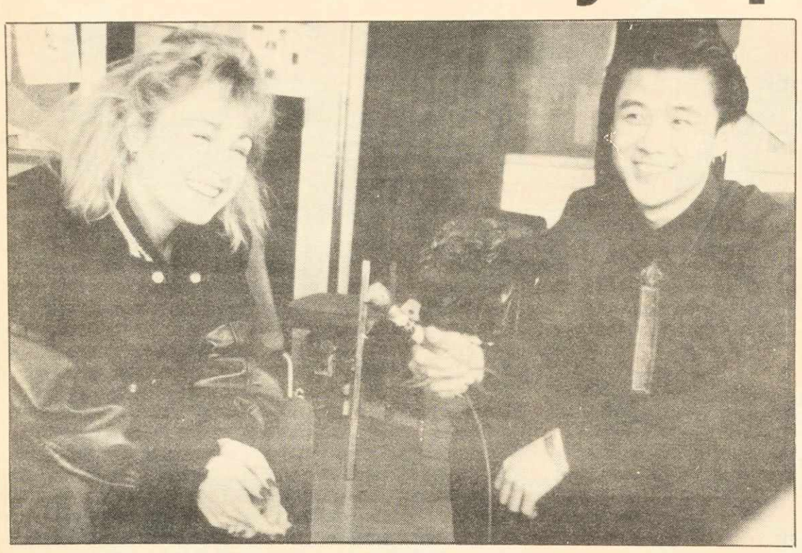
"Degrassi Talks" to Gazette