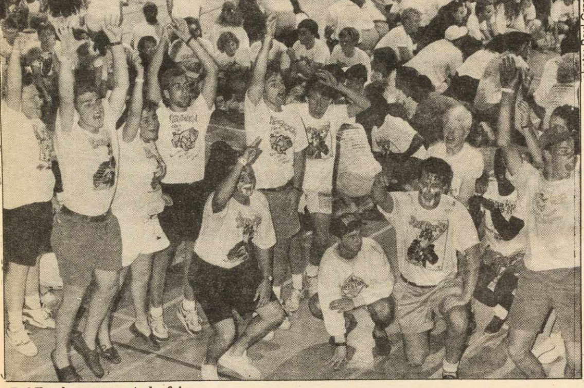
Dal Frosh go crazy at playfair

Unfortunately Shinerama, the only frosh week activity that had a purpose didn't live up to its expectations.