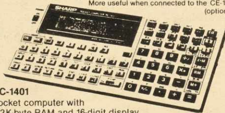
PC-1401 Pocket computer with 4.2K-byte RAM and 16-digit display.

59 preprogrammed scientific functions in CAL mode plus 18 BASIC command keys offer a variety of computing and calculating. More useful when connected to the CE-126P (optional).