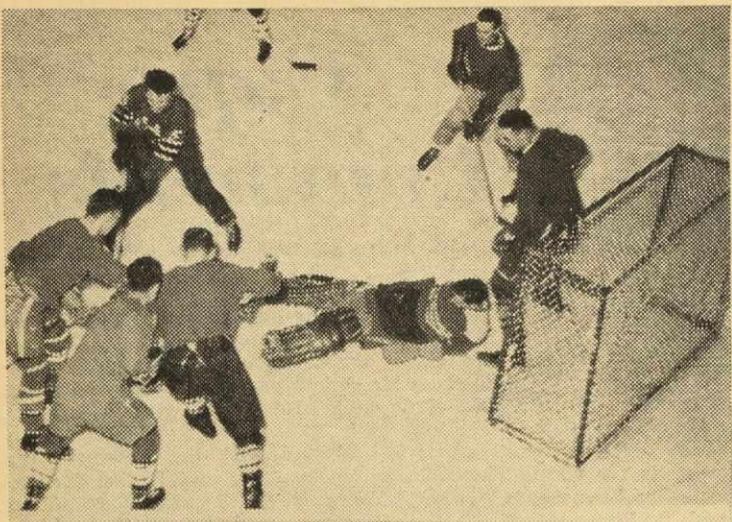
Fast and furious goal-mouth action is the rule of the day in inter-fac hockey play.