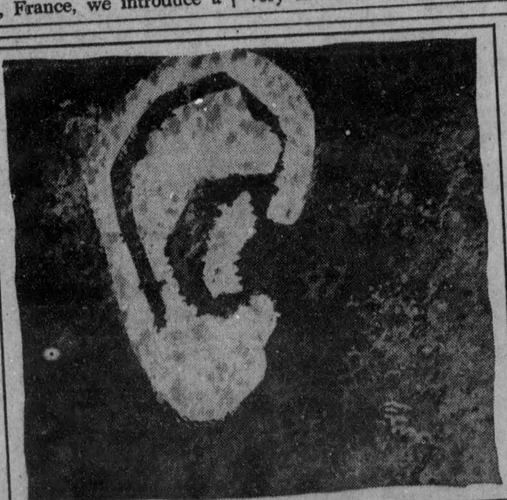
We bend an ear to undergraduate money problems of all kinds, from setting up a savings account, to budgeting, to discussing your financial future. Any time we can be of help . . .

Her reaction to the announcement that she was a candidate for Arts Queen was sim-ple and straightforward, "I am very flattered, as a matter of