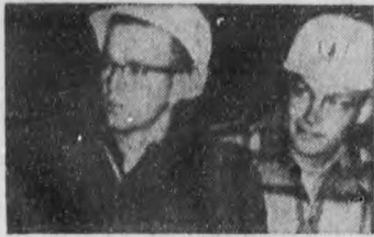
Look at that Guy go!