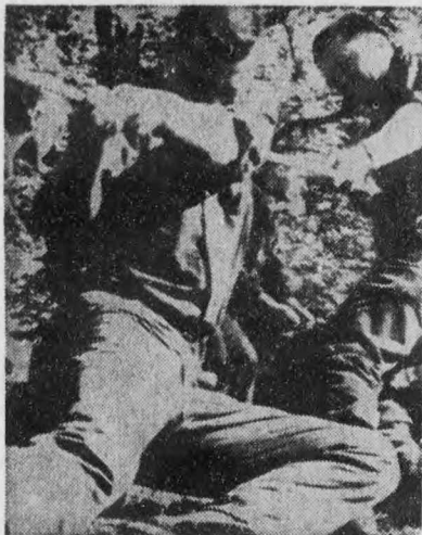
Oh, for that Extra Beer!