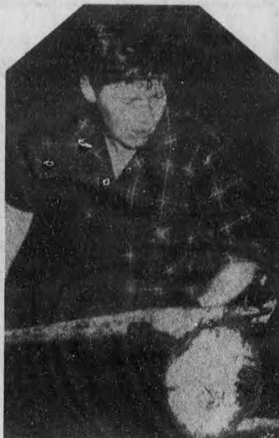
Oh, my Appendix!