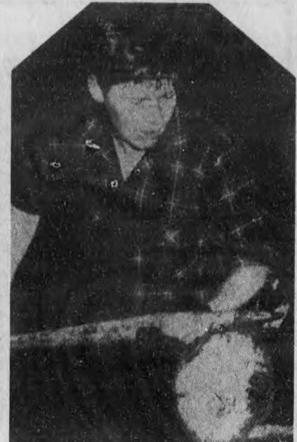
Oh, my Appendix!