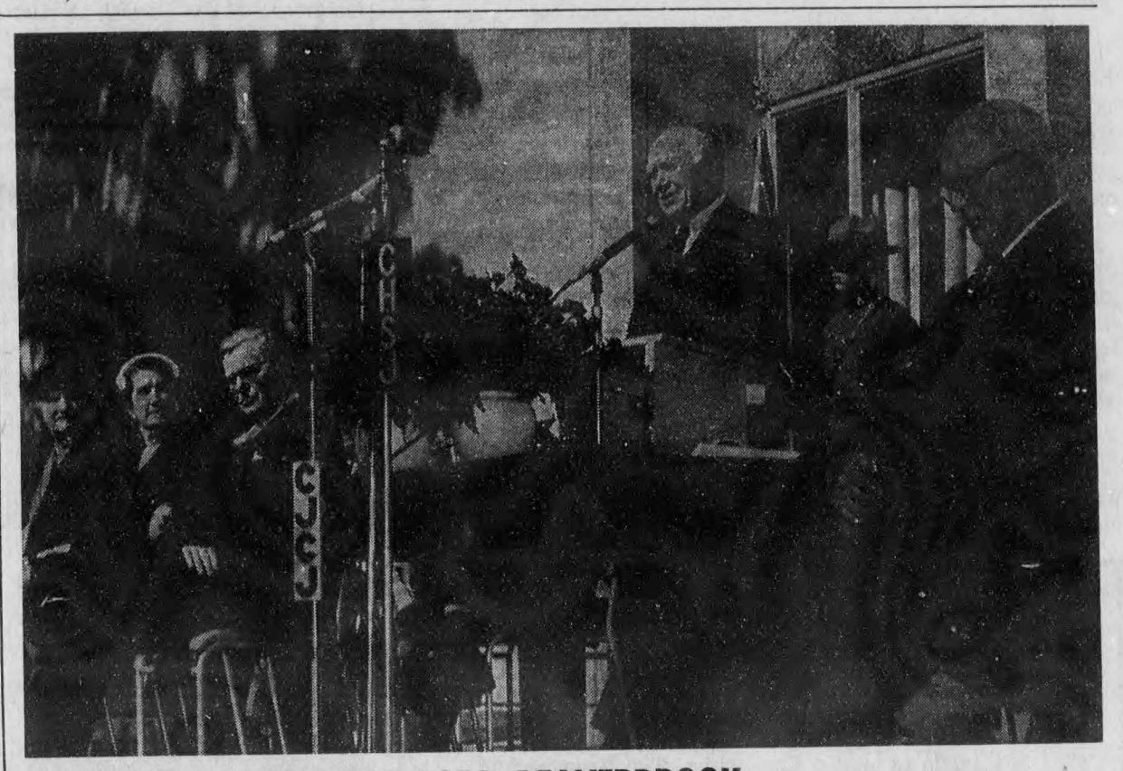
menting on the early start said THE RIGHT HONOURABLE LORD BEAVERBROOK, Chancellor of the University of that it was in keeping with a pro-

A recent development, and another step in the UNB building plans, was the calling for tenders for the construction of the new arts building. This building will be the second to be supported by funds collected in the building campaign. The first is the physics and biology building. The arts building, when completed, will be a three-storey building with two wings. One wing will contain classrooms, while the other will hold faculty offices. It is scheduled for completion by the fall of 1960.