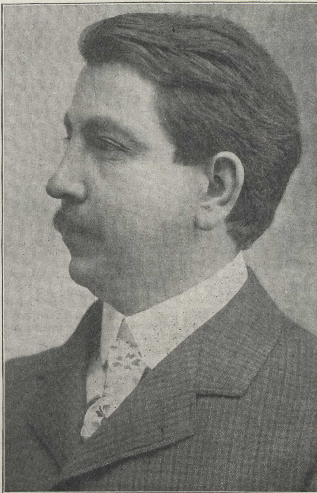
DR. HENRI S. BELAND New Postmaster-General and Member for Beauce, P.Q.

S UCCESSING Mr. Lemieux—Dr. Beland, of Beauce, who, on Parliament Hill, has played baseball with page boys; a man most democratic, un-Nationalist and anti-Bourassa; beloved in rural Québec, which, in a remarkable manner, he impersonates. Dr. Beland is a young man. As P. M. G. he will be energetic, resourceful and urbane. He has been in the House since 1902, when he took the seat of Mr. J. Godbout. Always quiet and unobtrusive he has seldom spoken in the House, though he is one of the ablest speakers in both French and English. He will now be heard more. Barring Hon. Mackenzie King he is the youngest Minister. Three years ago he was first made prominent by being appointed with Honourables Sydney Fisher and Clifford Sifton