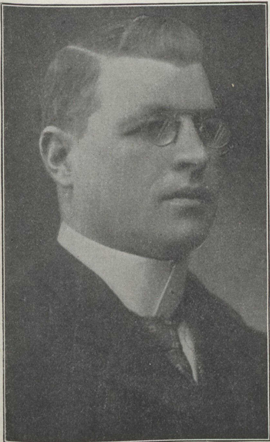
MR. HUGH GUTHRIE, K.C. Who may succeed to the Portfolio of Justice

M ORE Ministerial shuffle. With the resignation of Mr. Brodeur, so long desired by the Toronto News , Hon. Rodolphe Lemieux takes charge of Marine—inclusive of Niobe, Rainbow, and the Arctic. In the post-office portfolio he inherited a large surplus, somewhat derived from penny postage, good management and the absence of hard times. He inaugurated rural delivery and reduced urban rates to a cent for an ordinary letter—which has made it extremely difficult to recollect that a two-cent stamp has any business on a letter to any address except in case of writing on love or baseball. Mr. Lemieux is a very urbane, smooth-going French-Canadian. Before Hon. Mackenzie King became Minister of Labour he had time to invent the Lemieux Act for the amicable settlement of labour disputes without strikes; said Act having kept Mr. King busy settling strikes most of the time since. It does not look as though the Marine Department will furnish Mr. Lemieux with as much chance for distinction as did his old portfolio. His first journey since being sworn in last week was with Mr. Bourassa, on Sunday, down at St. Hyacinthe.