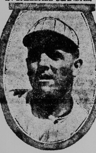
Ed Cicotte, former pitcher for Chicago White Sox, who has confessed to accepting a bribe to "throw" the series with Cincinnati Reds last year.

Phone 3028 Store Open Evenings. 7 WATERLOO ST. (Near Union St.)