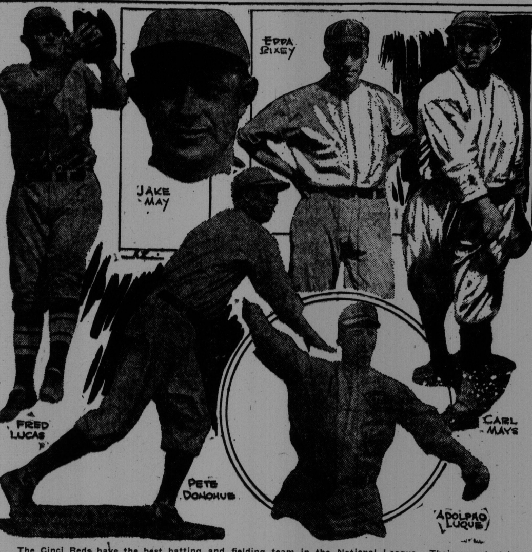
The Cincinnati Reds have the best batting and fielding team in the National League. Their recent strings of victories over the Pirates and Cardinals have given the Red fans hope of a flag. This hope may be realized if the "big six" of the pitching mound—Donohue, Mays, Luque, Lucas, Rixey and May—carry their end.