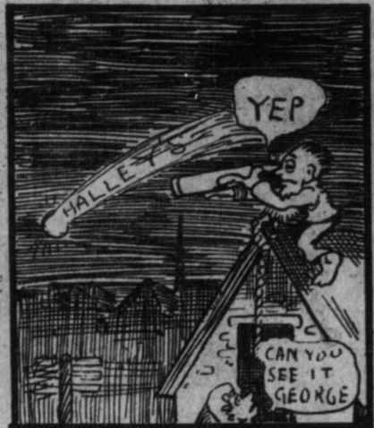
3.30 O'CLOCK—HALLEY'S COMET RAGE.