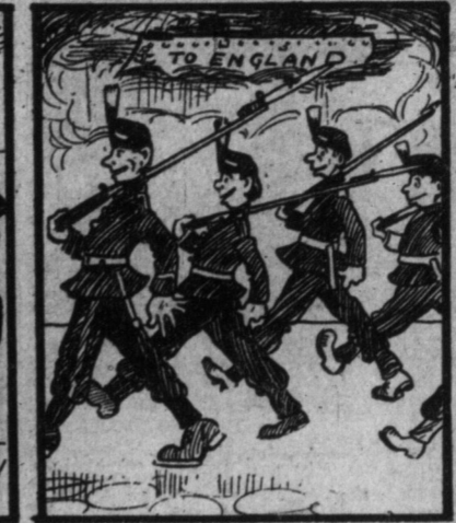
Q. O. R. PREPARE FOR ENGLISH TRIP.