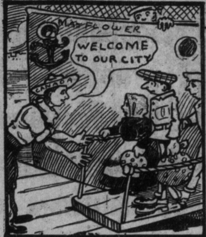
MANY NEW-ARRIVALS FROM OLD LAND.