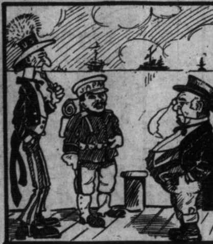
GT. BRITAIN MUST CHOOSE.