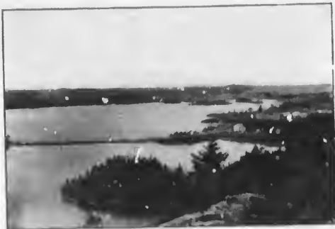
HEAD OF LAKES, SHOWING ISLANDS.

Dartmouth is the second largest town in the province and is the home of several manufacturing plants.