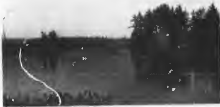
ON SECOND LAKE.

Teams may be hired in Dartmouth cheaper than in Halifax.