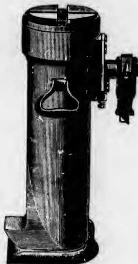
40 Ton Bridge Jack.

Special Jacks any Style or Capacity Made to Order at Short Notice.