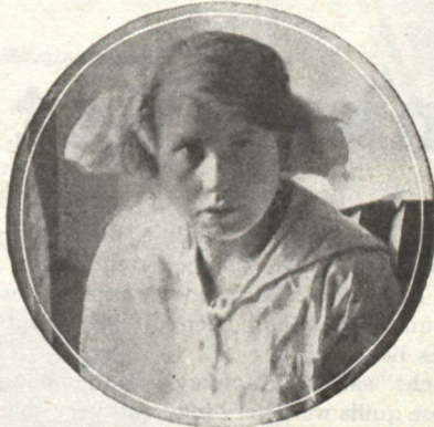
This girl of 8 years looks indeed as if the burden of a thoughtless world were upon her shoulders. The utter lack of intelligence, as shown on her face, surely demands better care than she and hundreds of others like her are now tendered.

problem, but who cannot rightly be classed as either feeble-minded or insane.)