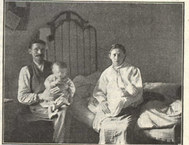
Case of "manic depressive insanity" which tends to change victims from a state of unusual exhilaration to one of deep depression. This father is unable to leave his children and the family is living on public charity.

abnormality. I recall one case of a feeble-minded boy who, in company with a gang, entered the home of a well-known surgeon who was serving his country overseas. This boy was not content merely to steal valuable belongings, but took pleasure in wantonly