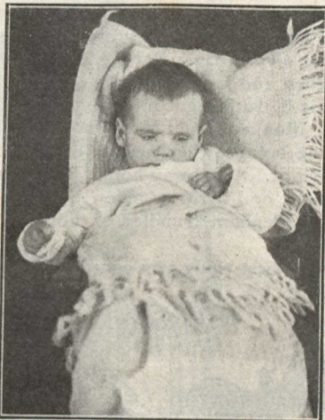
A nineteen-month-old baby with defective eyes, which are common in cases of idiocy. This frail bit of humanity should be given a fighting chance in life.

O VER 3,000 delinquents that appeared before the Judge of the Toronto Juvenile Court were referred to the Psychiatric Clinic of the Toronto General Hospital for examination. This study