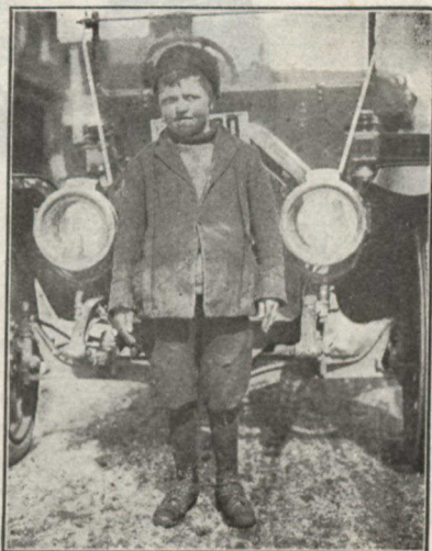
This boy of 14 years is typical of the mentally deficient thief. Our reformatories and detention institutions are full of them. How much better they could be treated in school or college, where hope might be inspired rather than despair.