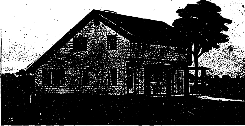
Design No. 4.—Front view of an unusually graceful design for a suburban house. The walls are covered with shingles or clapboards; the roof shingled; the terrace of cement or vitrified brick. The pergola, which is shown in this view, is of a rustic character.

The farmhouse (Design No. 4) is an exceptionally good one, not only because the building, simple as it is, is unusually graceful in line and proportion, but because the interior is so arranged as to simplify greatly the work of the household and to give a