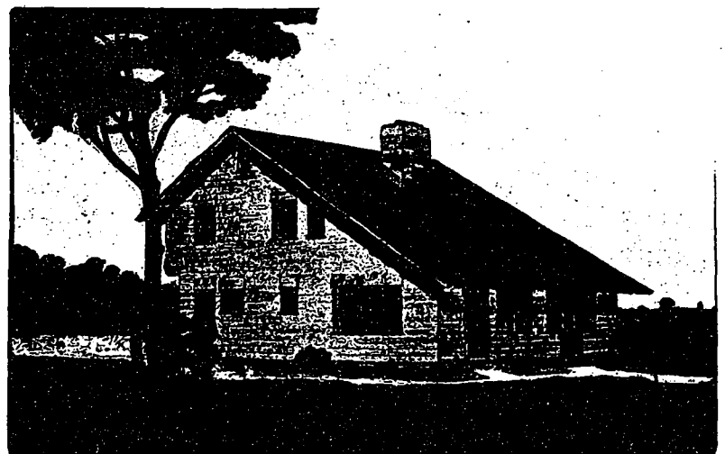
Rear view of Design No. 4 of suburban house, showing the broad sweep of roof. Note the slight projection in the shingled wall that forms a cap over each window or group of windows. This not only affords protection, but is a very interesting feature of the construction.

The dining room is simply a continuation of the living room, from