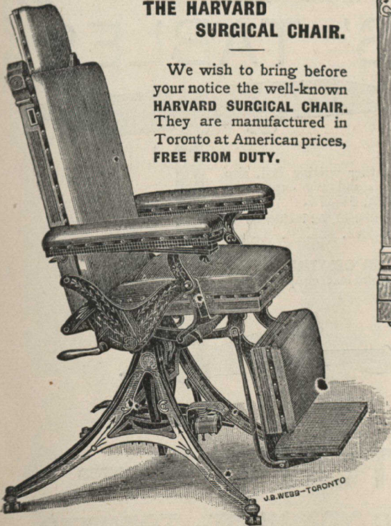
The Harvard in the upright position with head rest folded back.

We wish to bring before your notice the well-known HARVARD SURGICAL CHAIR. They are manufactured in Toronto at American prices, FREE FROM DUTY.