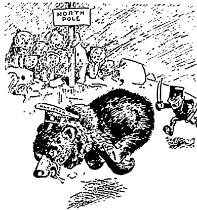
"Kuropatkin has left Mukden in safety and is moving north."—News Dispatch.

The birth of an heir to the Imperial and royal households of Russia and Italy brings into sharp contrast the outlook of these prospective sovereigns. For the one innocent babe