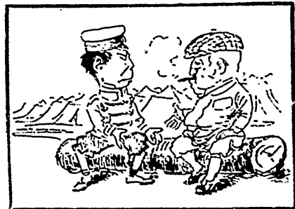
Japan continues to persuade England that the war cannot be carried on without money.

Though Britain takes no advantage of the tremendous blunder of the Russians in the North Sea, the hysterical fears and demented action of the Russian armada has made it the laughing-stock of the world. If in the home waters it mistakes fishing boats for hostile cruisers and recklessly rakes these peaceful craft, and also German, Danish, and