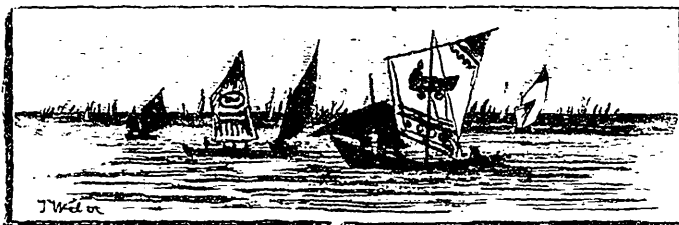
ITALIAN FISHING FLEET.