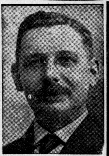
Your Vote and Influence Solicited