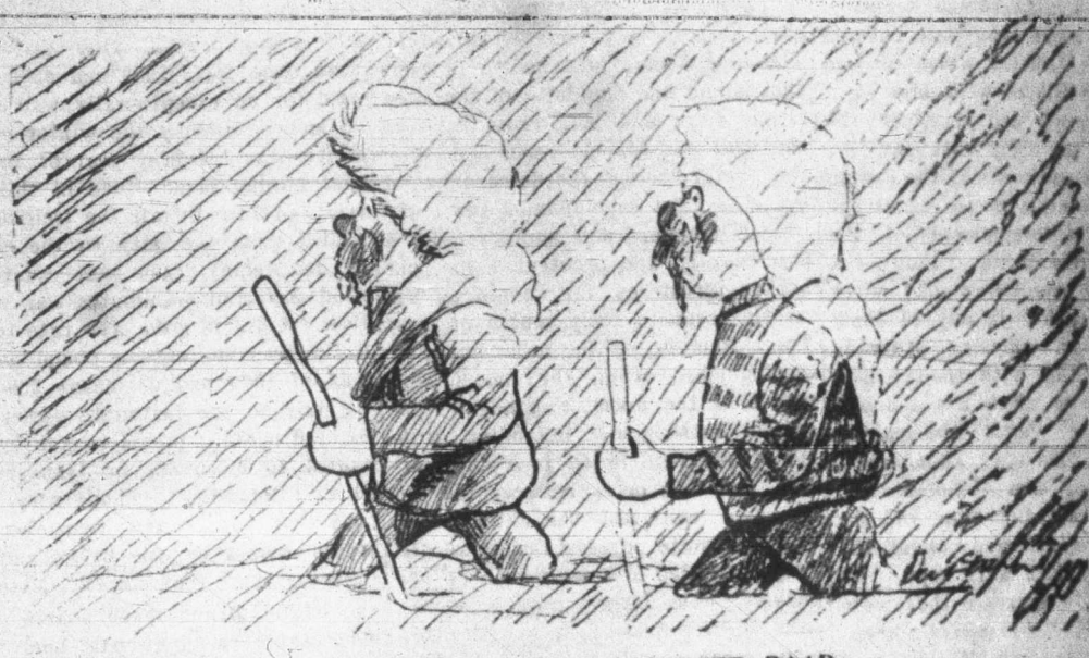
2. -VE BA DE FIRST TO GEET DAAR.