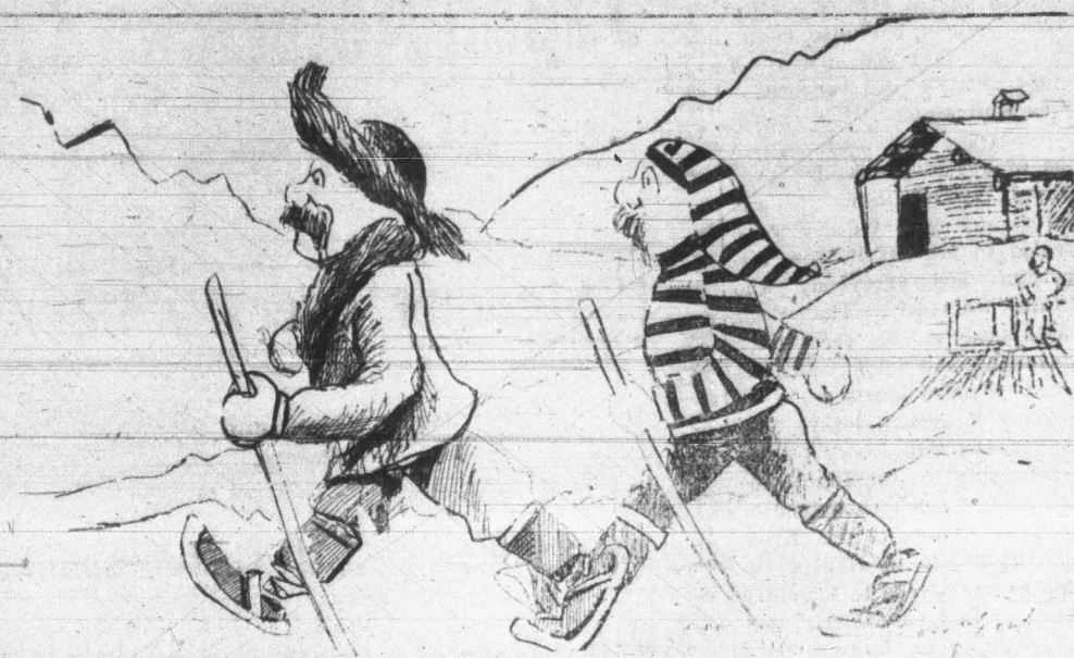
1. AY TANK VE GO STAMPEDIN'.