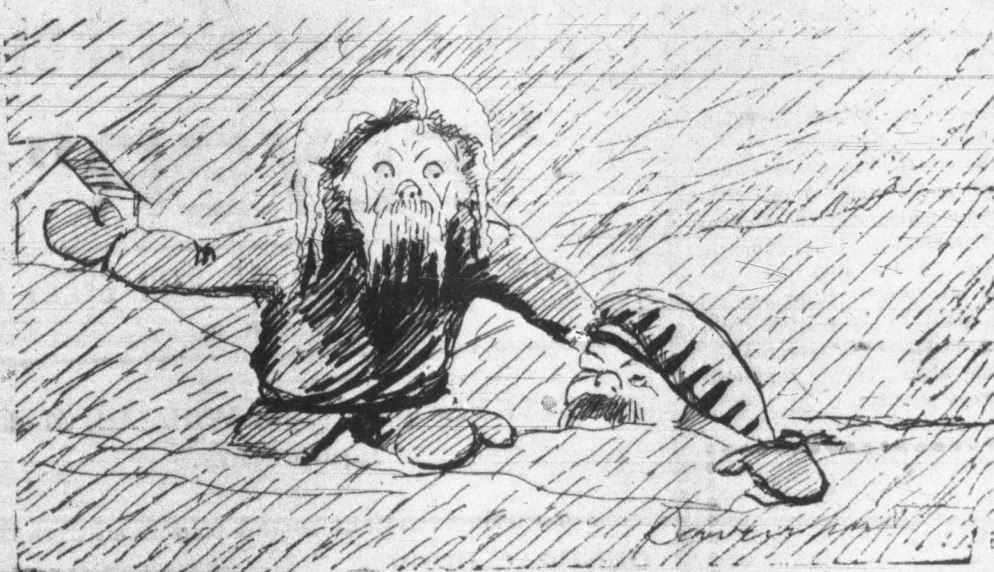
3. -DAAR EES CABIN! KOOM ON, OLE!