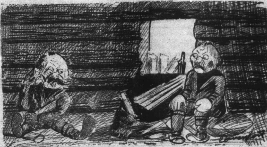
7. -EEN DA MORNIN' VE GO HAME AN' STAY DAAR.

He—I hope you were favorable. She—Oh, yes. I told her I didn't believe she could do any better. —Town Topics.