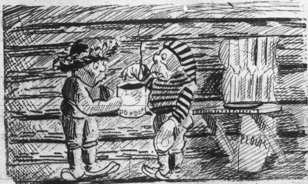
5. -BA DA YUMPIN' YIMMINY. EET BA COFFEE!