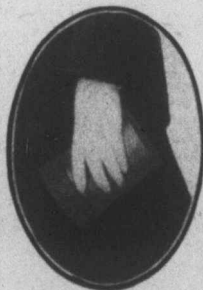
A full pail ensures the satisfaction and confidence of your customers.