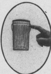
A partially filled pail invites mistrust.

Whenever you exceed the proper amount you forfeit just so much of your profit.