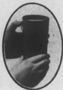
Ordinary pails are not made exact measure.

Whenever you exceed the proper amount you forfeit just so much of your profit.