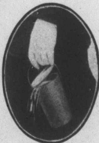
Empire Containers are exact to measure.