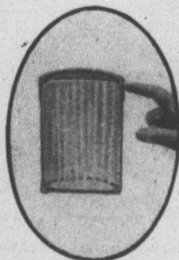
At any angle the Empire Container is safe and sure from spilling.