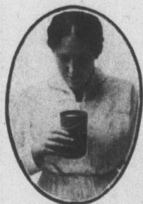
The slightest jar jolts the ordinary pail and spills part of the contents.